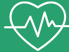
Medical Device & Supplies Manufacturing