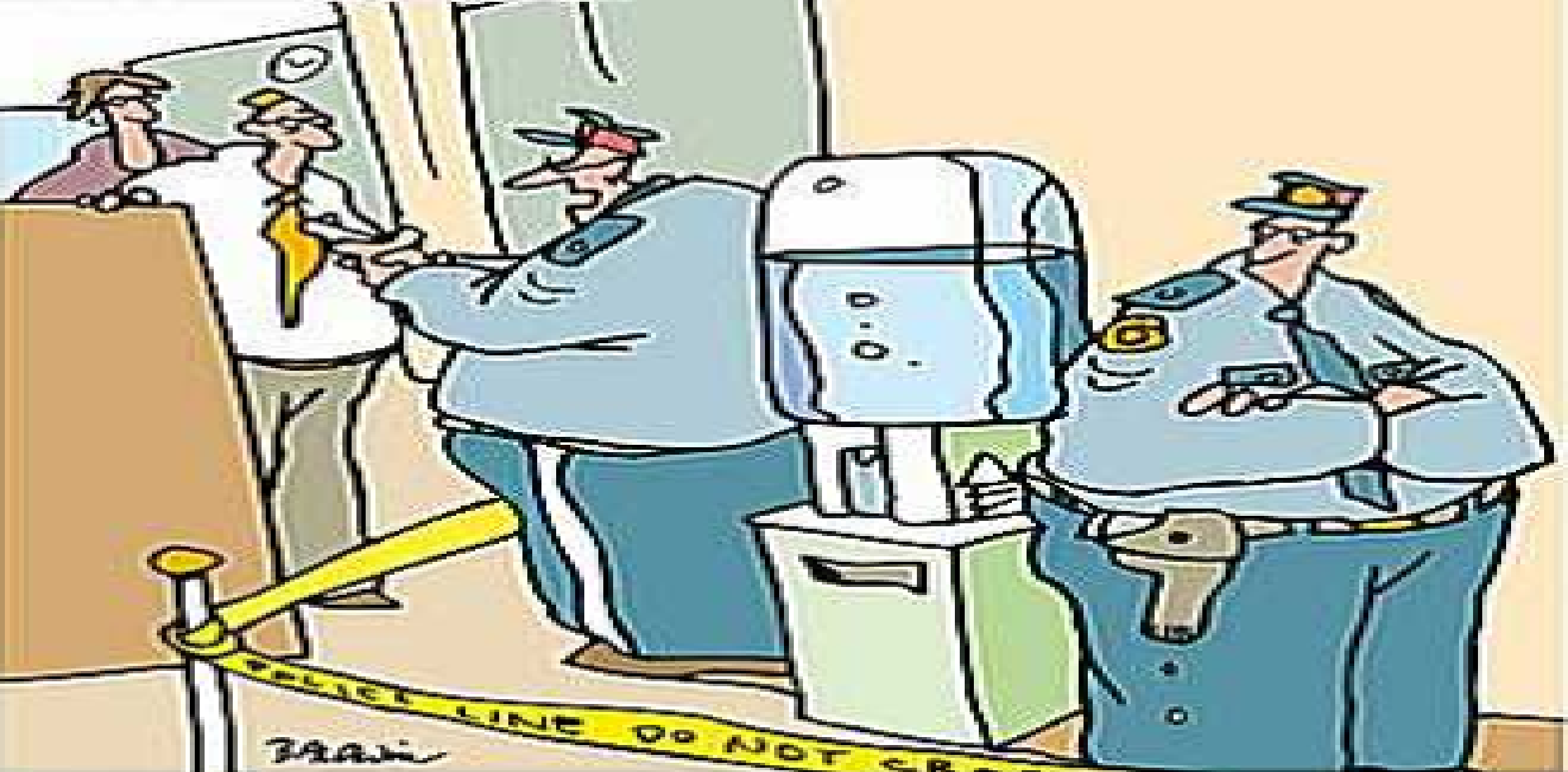
The day the government stepped in to ensure our water was safe.