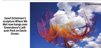
Janet Echelman's sculpture Where We Met now hangs over Greensboro's LeBauer Park on Davie Street.

Where We Met: Where We Met is an undulating, colorful net hung high above LeBauer Park's Great Lawn from five mammoth pylons positioned around the perimeter. The connecting shape from which the net is draped mirrors an 1896 map of N.C. railroad tracks connecting many of the state's major textile hubs at the time. Where We Met is the first permanent sculpture of this style in the region and is the result of a $1-million grant by The Edward M. Armfield, Sr. Foundation, which commissioned The Public Art Endowment at The Community Foundation of Greater Greensboro to manage and execute the project.